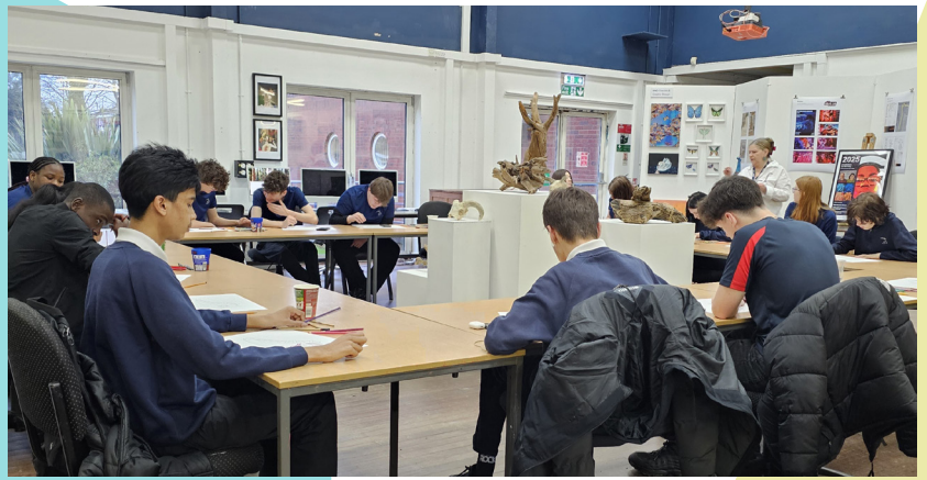
Tyne Met Visit