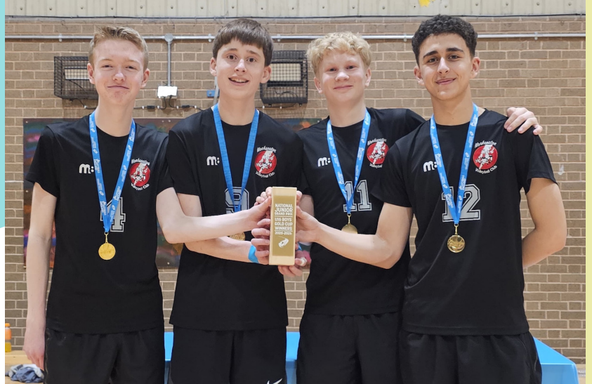
Under 16 Gold Winning Volleyball Team