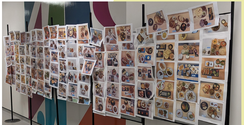
Food Practical Exam