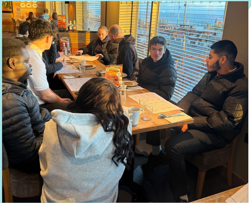
Revision Breakfast Event