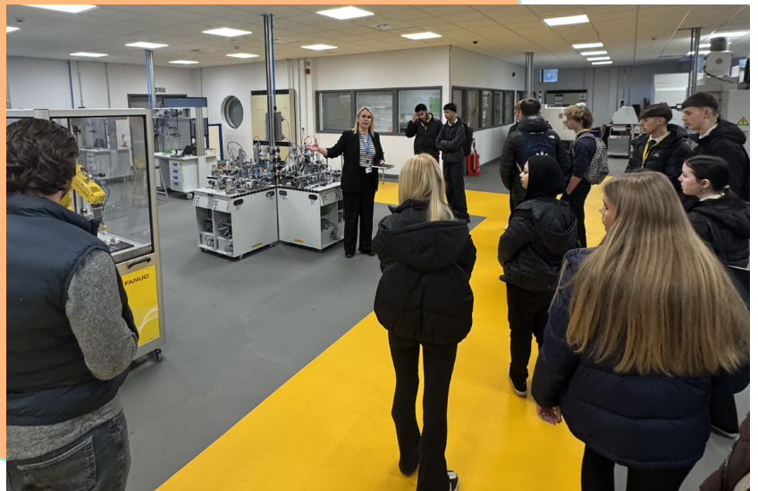
Newcastle College Visit