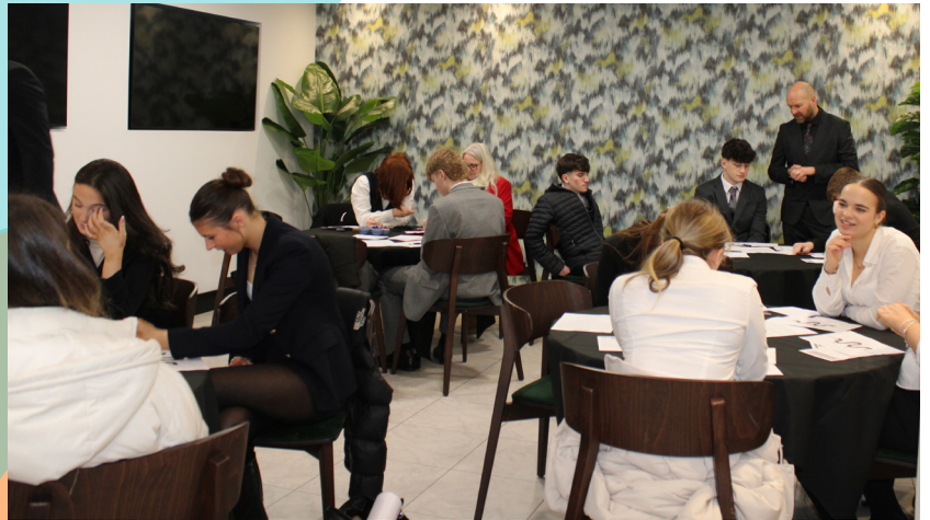
St James' Park Event